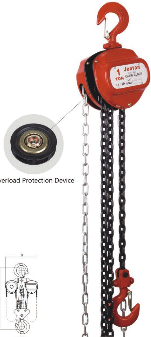
Overload Protection Device