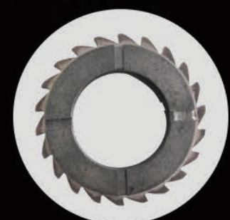
Patented Fused Brake