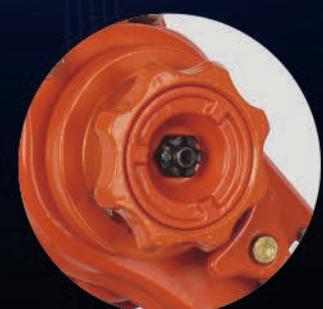
Unique Anti-release System