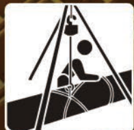
Laying Conduits And Pipelines