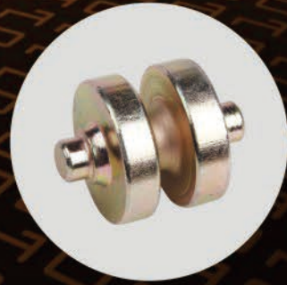
Casting Guide Wheel