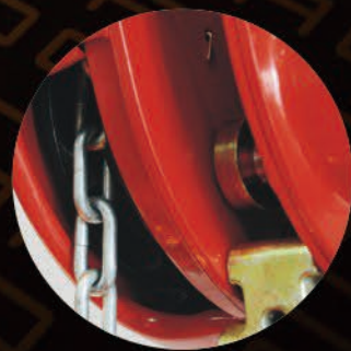
Unique Curled Edge